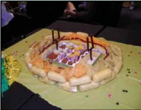
Super Bowl Party – football and creative food displays!