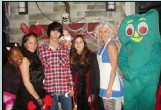
Halloween Party - even Gumby made an appearance!