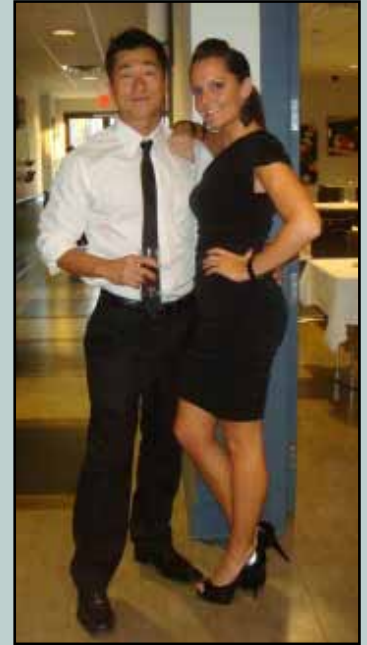
Black and White Party – a night of good music