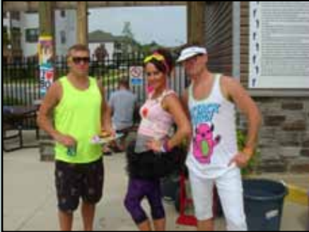
80s Party – a day filled with bright colors