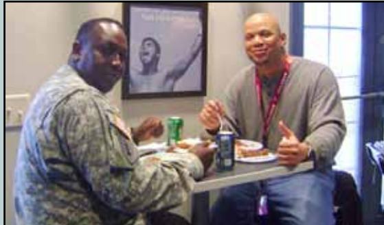
Thanksgiving Luncheon – talk about a delicious lunch break